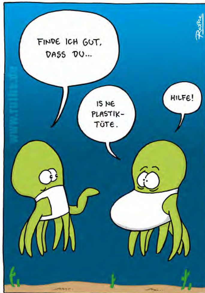
I think it is good that you... it's a plastic bag !!! HELP!!