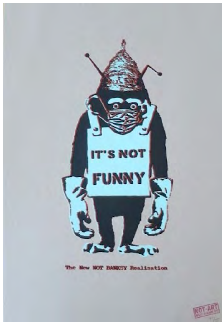
"That's much better!"