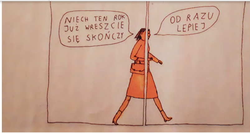
"Let this year finally come to an end"